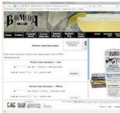
Portion Cost Calculator