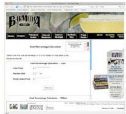
Cost Percentage Calculator