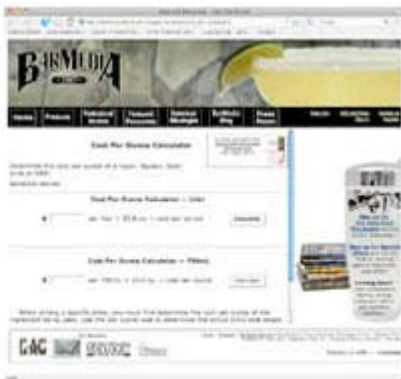
Cost per Ounce Calculator